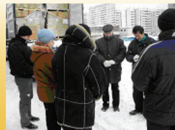
(This message is going around the world. Moscow above.)

"And when they had brought them, they set them before the council . . . Pe-